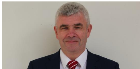
An Seánadóir Pádraig Ó Céidigh