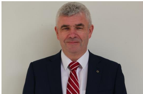
An Seanadóir Pádraig Ó Céidigh Cathaoirleach

Water is essential for public health and human life, the environment and the economy. While we are fortunate in Ireland to have an abundant supply of water in the environment, it is incumbent on us to use it in a manner that promotes conservation and that protects it from pollution.